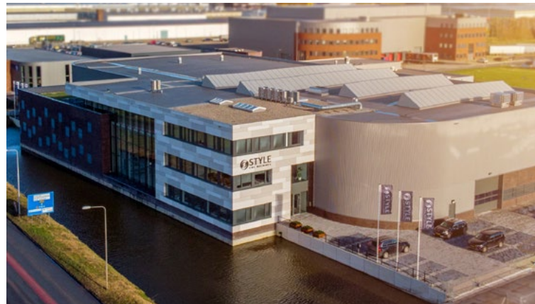
STYLE The Netherlands (assembly, service & sales)

Visiting address Twee-Bruggenstraat 64/201 B-8530 Harelbeke