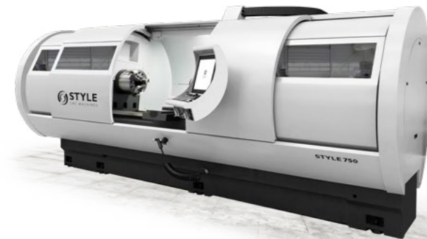
STYLE 650 / 750