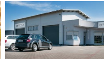
STYLE Poland (service & sales)