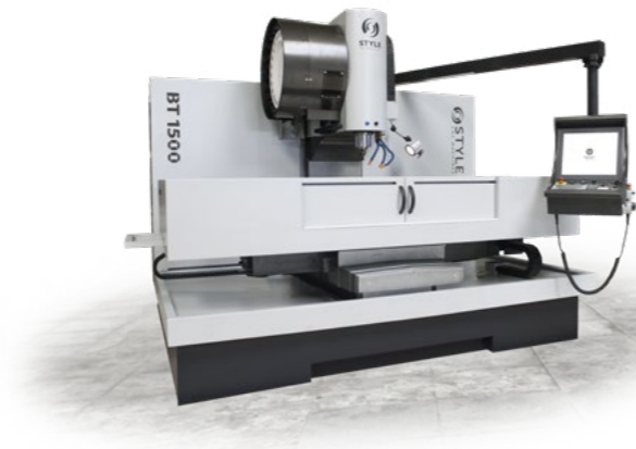
BT 1500 / BT 1500+