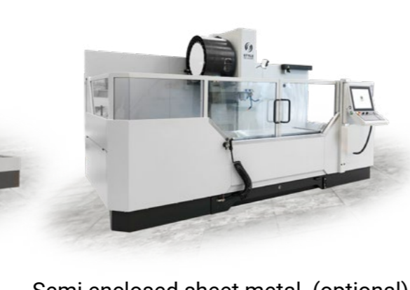
Semi enclosed sheet metal (optional)