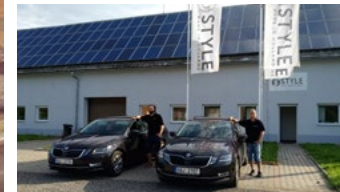
STYLE Czech Republic (service & sales)

Prices and specifications likely to change without notice