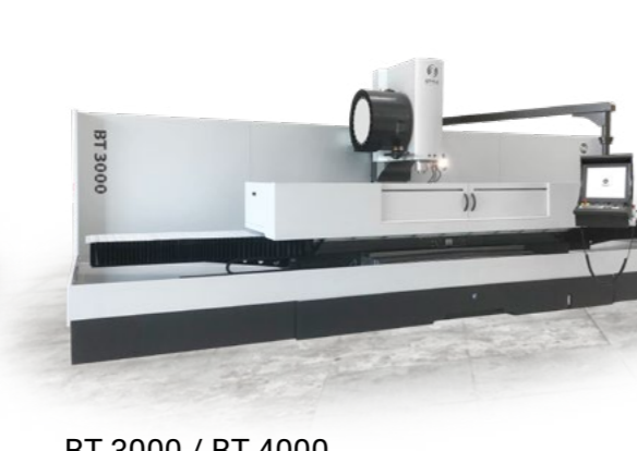
BT 3000 / BT 4000