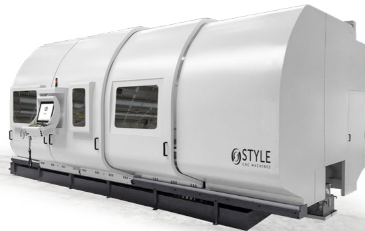
STYLE 1000 ~ 2200